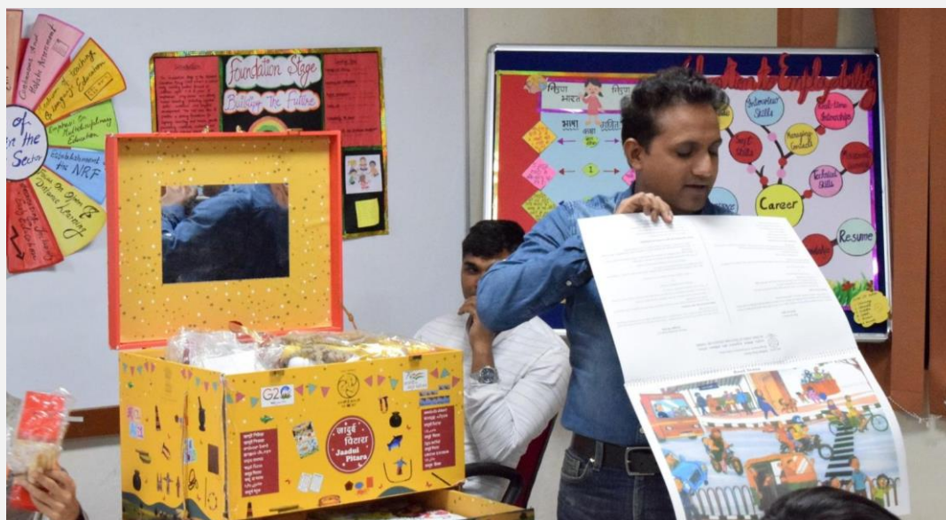
Demonstration of NCERT Learning material 'Jadui Pitara'

The department organizes Manodarpan and Sahyog: Programmes on Mental Well-being of Ministry of Education SAHYOG. The department organized the theme based conferences, seminars, and consultation meets at regional and national level.