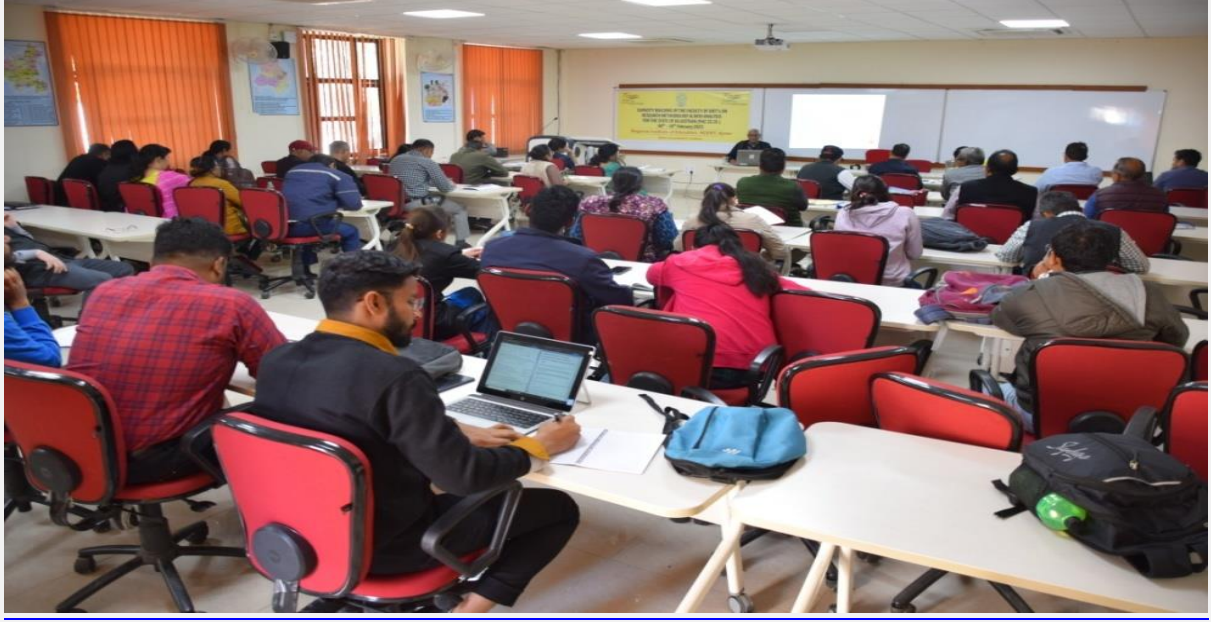
During capacity building programme at Seminar hall

The detail of the faculty members of Department of Extension Education is available on https://rieajmer.raj.nic.in/