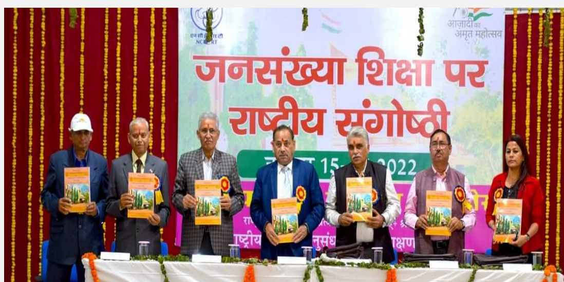
Release of Souvenir of National Seminar on population Education