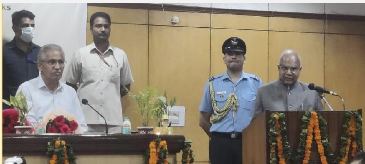
Hon'ble Governor Punjab and Administrator Chandigarh Sh. Banwarilal Purohit Ji Inaugurating consultation meet at Punjab University, Chandigarh